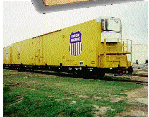
Because of its light weight, thermal performance, and strength, E'NRG'Y 2 foam is used for structural walls in refrigerated rail cars.