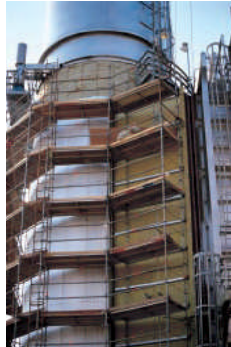
The light weight of Industrial Board makes it easy to install. It fabricates easily and cleanly with minimal cleanup.